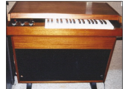
M400 – Walnut