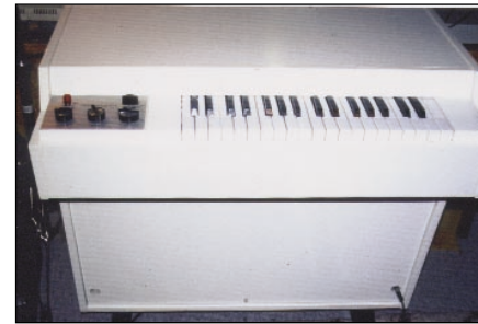
M400 – known as 'Snowwhite'

A full-bodied unicat especially recorded for Patrik Moraz' live shows with Yes. Never heard on any recordings.