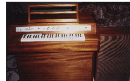
An M300 with speaker cabinet